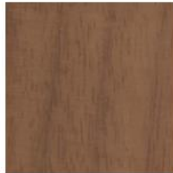
NOGAL NATURAL R-606