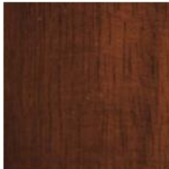
NOGAL CLASIC R-605